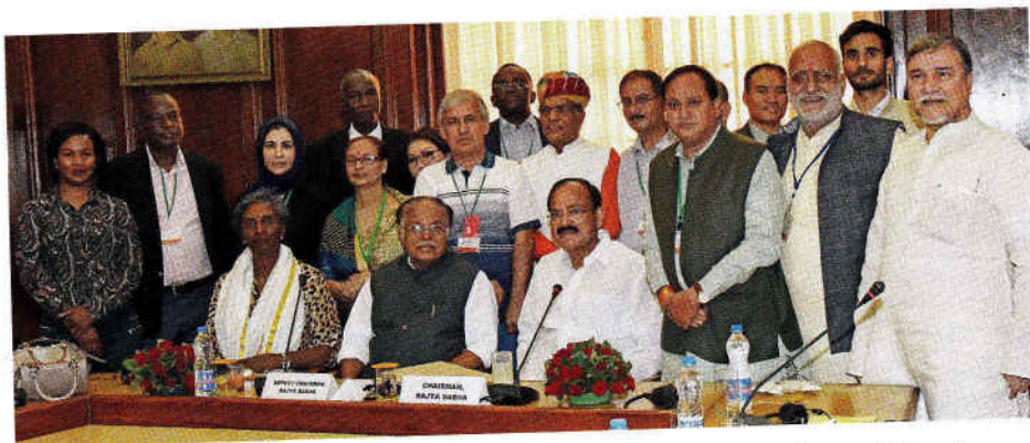
Hon'ble Vice-President of India, Shri Venkaiah Naidu, with the participants.

African countries. She said that such workshop helps in focusing the attention of the policy makers on most pressing needs of the mankind as enlisted in the SDGs. It also helps immensely in the capacity-building of the Parliamentarians.