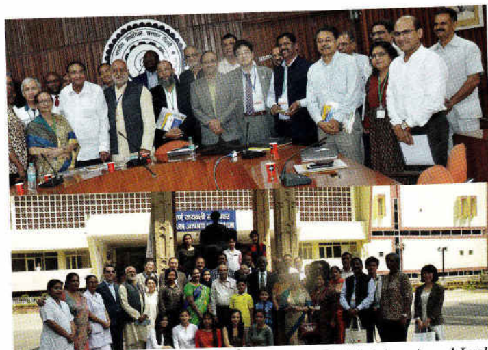
Participants during their field visit to IIT, Delhi (above) and Lady Harding Medical College, New Delhi (below).