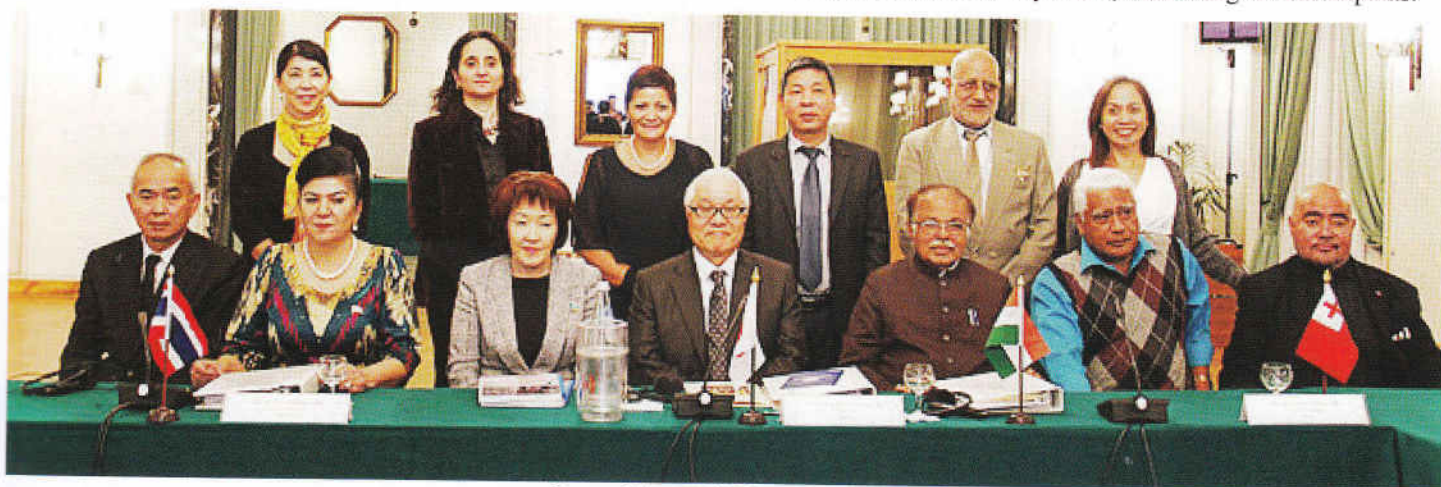
Group Photo of AFPPD Executive Members.