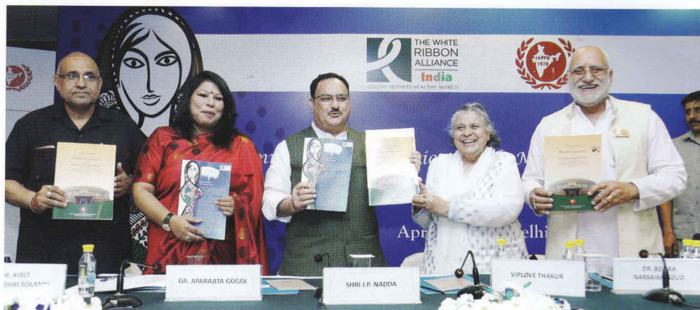
Shri J.P. Nadda, Union Minister of Health and Family Welfare, releasing the publications with other dignitaries on the Dais.

On this occasion, the report entitled 'Content Analysis of the Parliament Questions on Population and Health with Special Emphasis on Reproductive and Child Health (RCH) and Sexual and Reproductive Health and Rights (SRHR) (2014-2016)' was well-received by the Health Minister. This study was carried out by IAPPD and partly funded by AFPPD's Small Grant Programme.