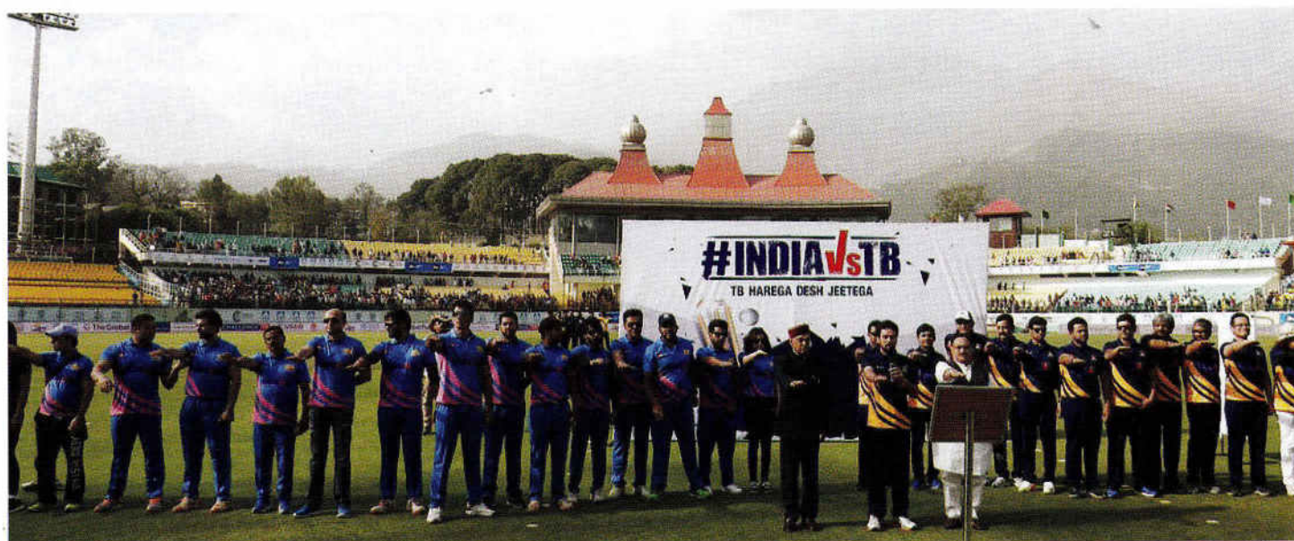
Shri J.P. Nadda, Union Minister of Health and Family Welfare and the teams taking pledge for a TB Free India before the match.

Representatives from civil society, Central TB Division, Ministry of Health and Family Welfare, The Union, the World Health Organization, the United States Agency for International Development (USAID), IAPPD and The Global Fund were all in attendance.