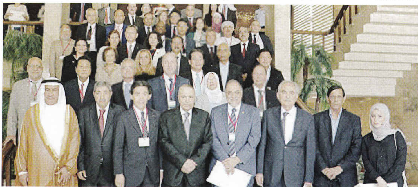
Group Photo of the Participants.

The meeting discussed and adopted a draft outcome document with focus on obstacles that Parliamentarians face and concrete measures to develop and introduce legislation to improve population and development.