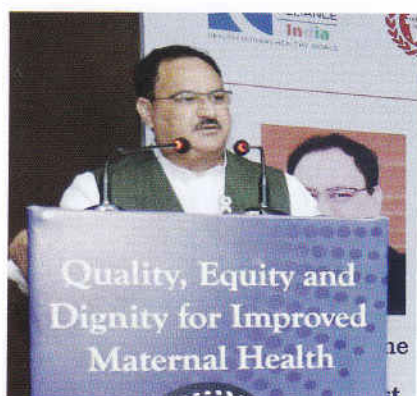
Hon'ble Shri J.P. Nadda, Union Minister of Health and Family Welfare, Government of India, addressing the participants.

To Commemorate the National Safe Motherhood Day on April 11, 2017, a meeting with Parliamentarians was jointly organized by IAPPD and the White Ribbon Alliance (WRAI) on April 10, 2017 at India Habitat Centre, New Delhi.