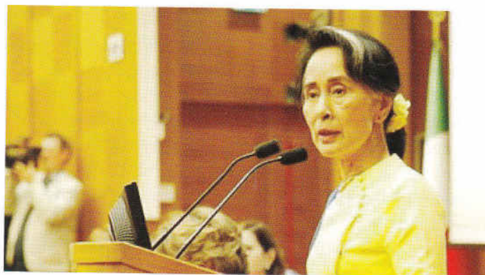
Noble Peace Prize winner Ms. Aung San Suu Kyi, the External Affairs Minister of Myanmar, addressing the Participants.

The Conference concluded with the Rome Parliamentarians' Appeal, adopted by the participating Parliamentarians from 45 countries. Among various action points, the Appeal urged world leaders to provide comprehensive sexuality education and establish a health system focusing on universal access to full sexual and reproductive health services, adopt policies that embrace migrants' contributions, and promote, protect and fulfill the human rights and fundamental freedom of all migrants, especially those of women and children.