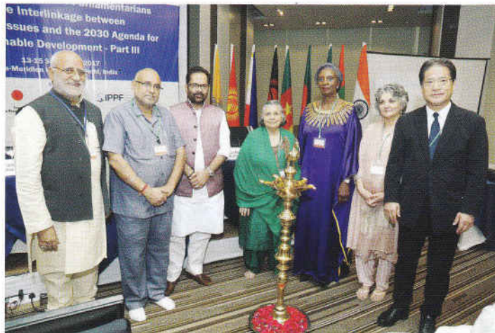
The inaugural session of the Conference.

Session 1: Implications of Population Issues for Achieving the 2030 Agenda for Sustainable Development