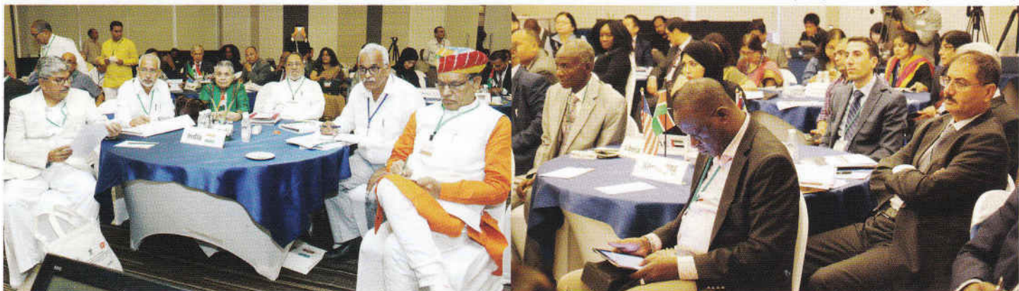
Participants during the Conference.

Hon. Ms. Naguni Effa stressed the need to extend cooperation among the developing countries particularly