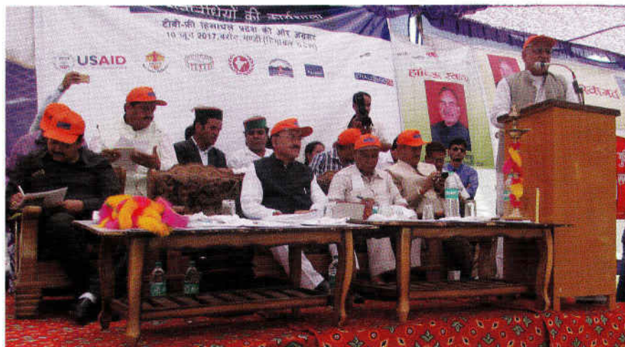
Dignitaries on the Dais during the Workshop.