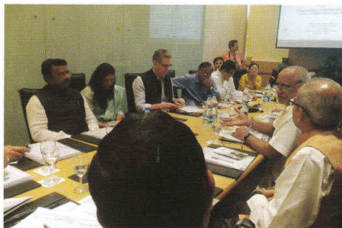
MPs and Legislators during the Meet.