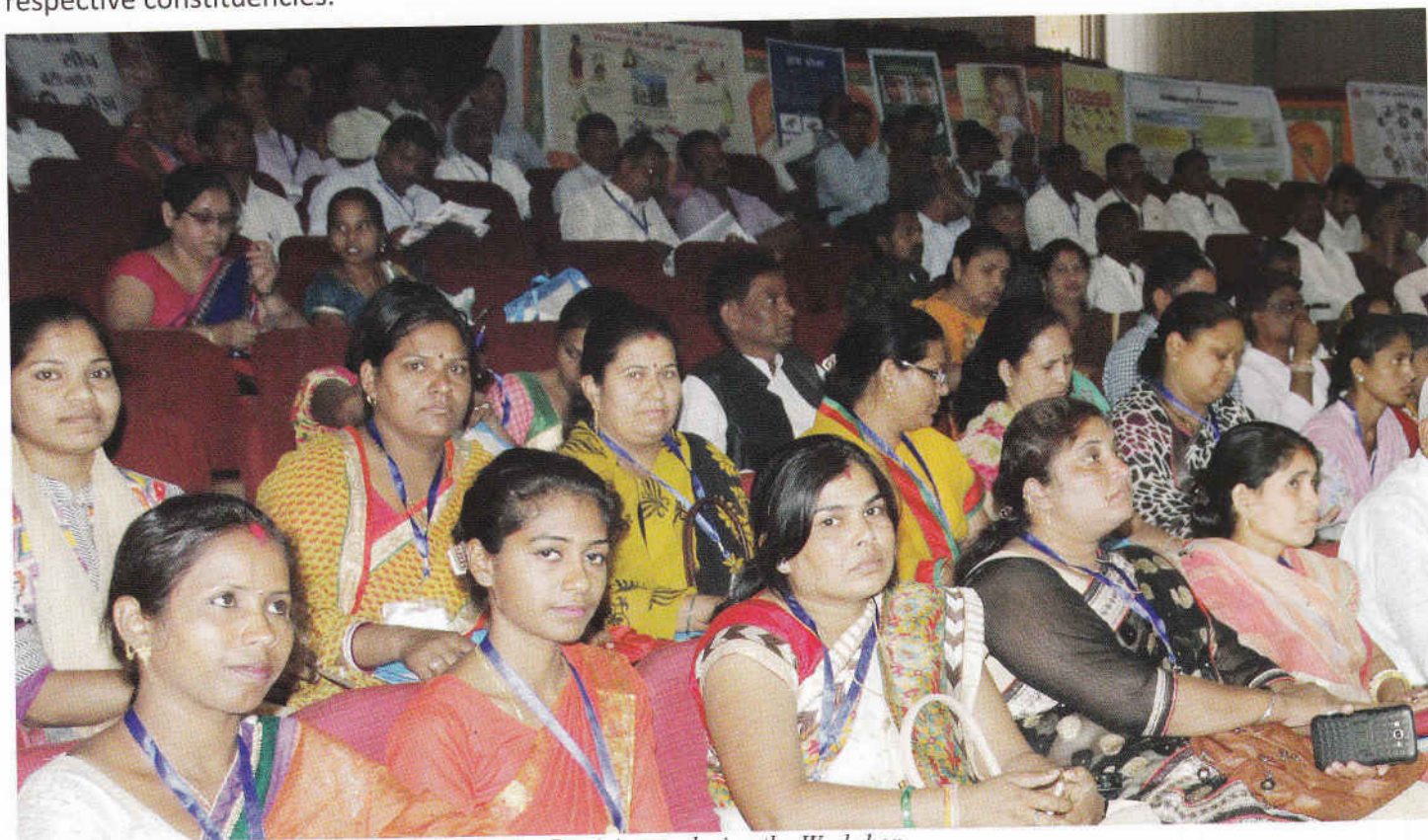
Participants during the Workshop.