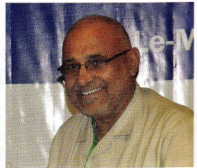
Shri Avinash Rai Khanna

Due to T.B., the possibility of severe chronic diseases like diabetes (sugar), HIV and AIDS also prevail. Therefore, the need for serious efforts at the government level is being made to eradicate this disease.