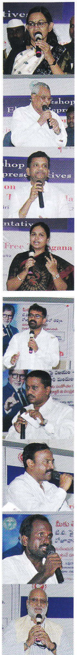
Speakers addressing the participants.

At the end of the meeting, PRIs pledged commitment to support for a TB – Free Telangana.