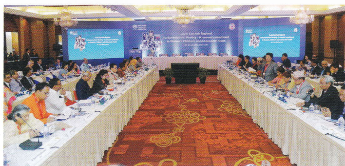
Interactive session during the meeting.

Strengthening midwifery care for the mothers and newborns, making emergency services and family planning services available, facilitating good nutrition, empowering women and giving them equal opportunities, and addressing inequalities in healthcare, are among the key measures that the Parliamentarians are best positioned to address and promote, the Regional Director said.