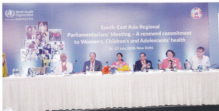
Mrs. Anupriya Patel, Minister of State for Health and Family Welfare, Government of India (centre) with other dignitaries during the inauguration of the meeting.

Adopting a 'Call to Action' at the end of the two-day 'South-Asia Regional Parliamentarians' Meeting – A Renewed Commitment to Women's, Children's and Adolescents' Health', the participants committed to contribute towards increasing national budgets for