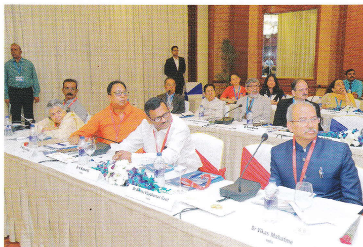
Members of Parliament from India during the meeting.

The Region, which accounts for one-fourth of the global population, one-third of newborns, and has over 360 million adolescents, the largest number of young population ever, has been making progress in advancing health of women and children. Between 1990 and 2015, maternal mortality rates declined by 69%, deaths in children less than five years of age reduced by 67% and newborn deaths rates declined by 57%.