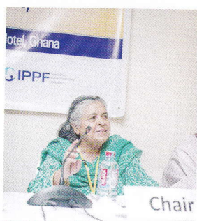
Mrs. Viplove Thakur, MP, during the meeting.

To provide a platform for Asian and African Parliamentarians to exchange their good practices and lessons learnt, promote parliamentary networking and further individual and collective supra-partisan actions to address population issues, a Parliamentarians' Meeting and Study Visit on "Parliamentarians as the Fourth Pillar for Achieving the 2030 Agenda: Population, Food Security and Sexual and Reproductive Health (SRH)" was organized in Accra, Ghana on August 8-10, 2018. The meeting was hosted by Asian Population and Development Association (APDA), Japan in association with Parliament of Ghana.