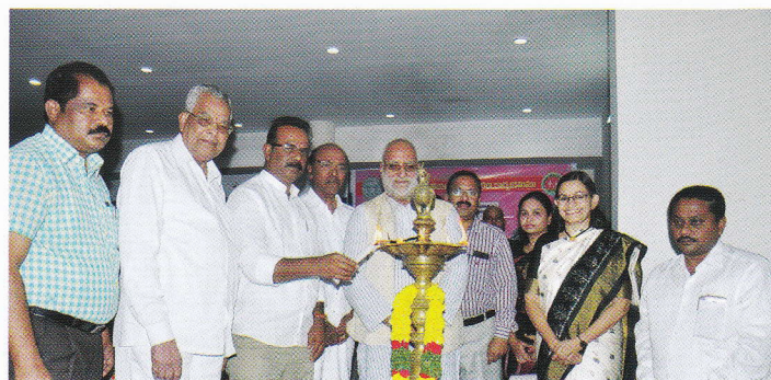
Inauration of the Workshop.

With the objective to sensitize the members of Panchayati Raj Institutions on the issue of Tuberculosis in Telangana and to discuss the role of PRI members in eliminating TB in their area, a 'One-day Sensitization Workshop for PRIs on Striving towards a TB-free