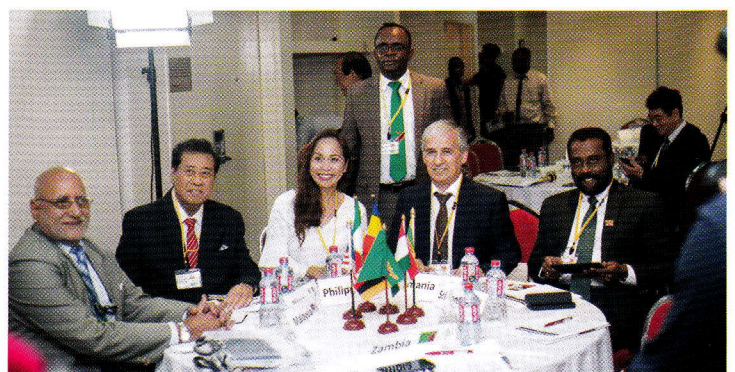
Participants during the discussion.

Accordingly, to achieve the SDGs, it is essential for Parliamentarians to encourage inter-regional exchange, share information, and take stock of progress on population and development issues. For this purpose, it is important to promote Parliamentarians' activities in which Parliamentary groups in respective countries can actively engage. We urge the Asian Population and Development Association (APDA) and other independent public interest organizations to provide concrete evidence-based proposals in support of the activities of Parliamentarians.