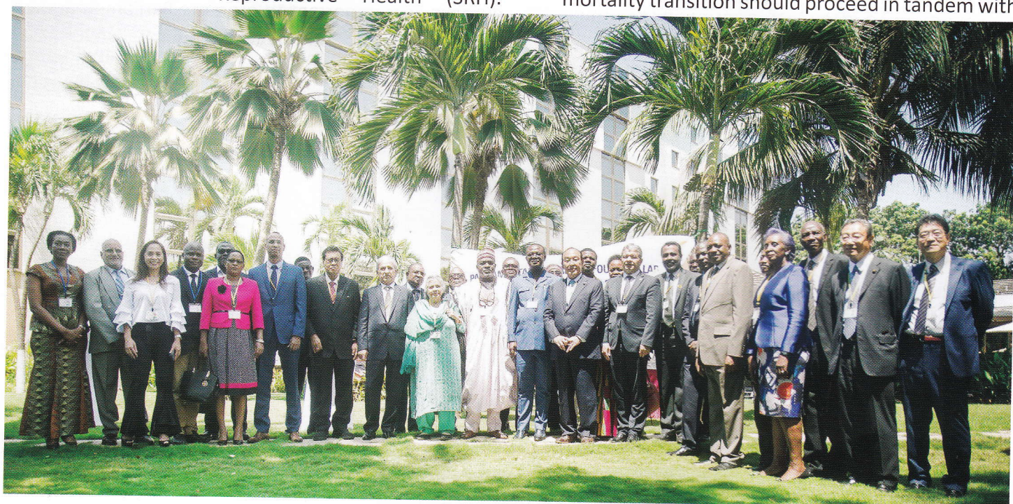
Group Photo of the participants.