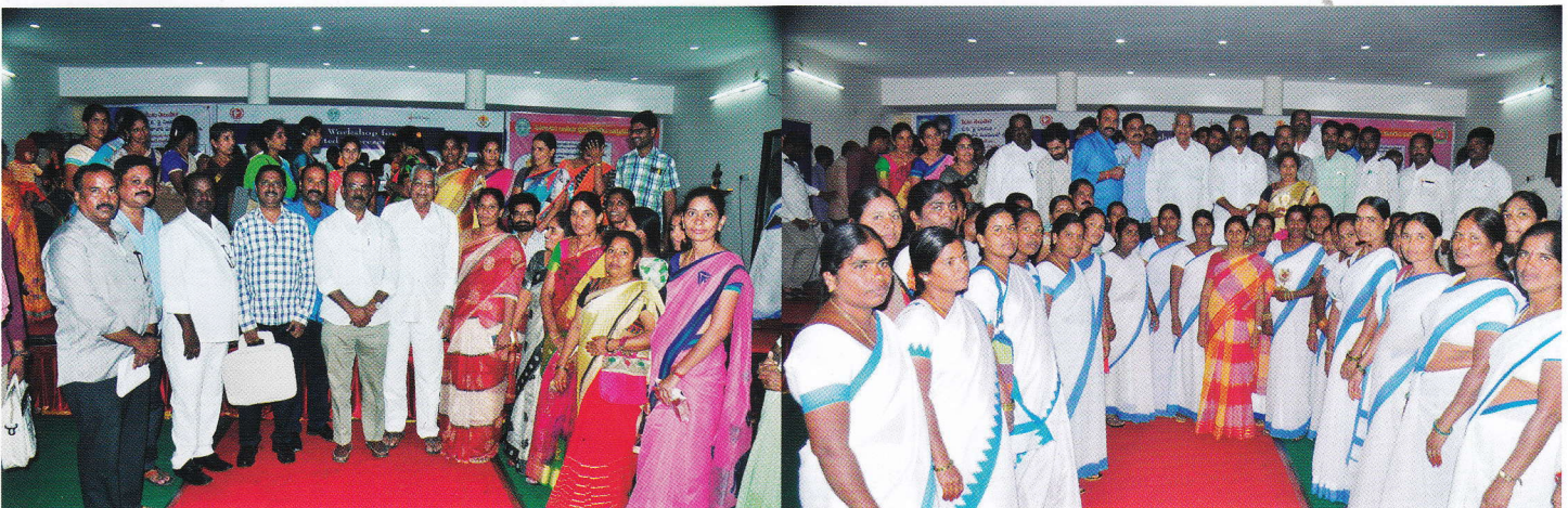
Participants with Chief Guest.