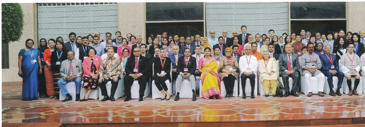
Group Photo of the participants.

Working across all sectors like health, water, education, nutrition and commerce to address the various determinants of health for women, girls and