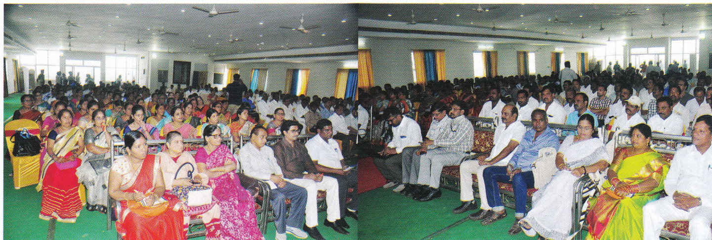
Participants attending the Workshop.