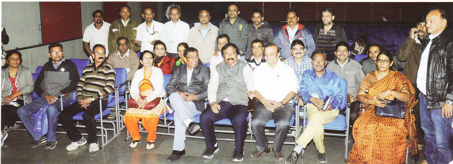
Group photo of the participants.

The workshop was well received by the Councillors. The participants also suggested that such workshops to be organized in other parliamentary constituencies also for the benefit of councillors of those areas.