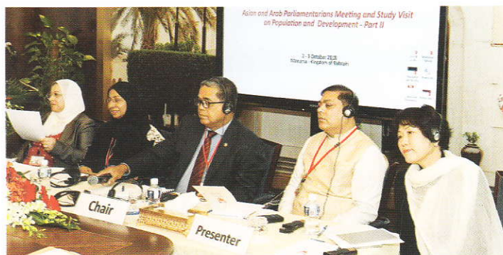
Mr. Nadimul Haque, MP, making a presentation during the meeting.