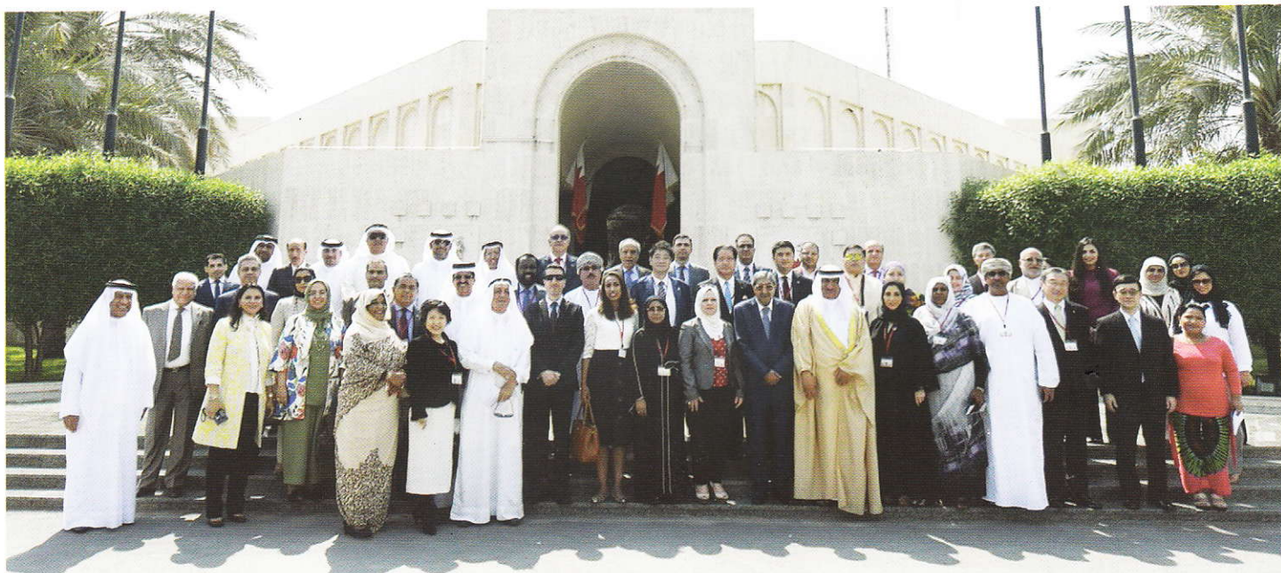
Group Photo of the participants.