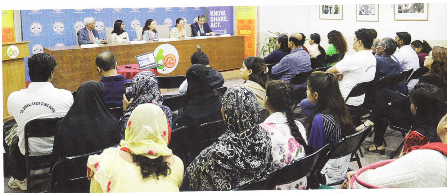
The launching of 50th Union World Conference on Lung Health.

The Conference theme resonates strongly with TB, but it also raises awareness that all threats to lung health – TB, air pollution, tobacco and many more – are emergencies that our science, leadership and action need to meet head on.