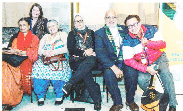
Indian delegation members with other participants.

More than 90 Parliamentarians from over 70 countries have agreed on a forward-looking declaration that aims to foster understanding of and consensus around the urgency to address current political discourse on sexual and reproductive health and rights (SRHR). Meeting over two days in Ottawa, the gathered parliamentarians renewed their commitment to the 1994 Cairo International Conference on Population and Development (ICPD), and discussed progress made towards implementing its recommendations.