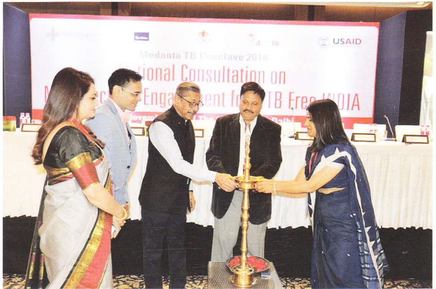
Inaugural session of the Conclave.