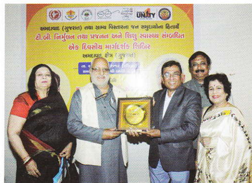
Inaugural session of the workshop.