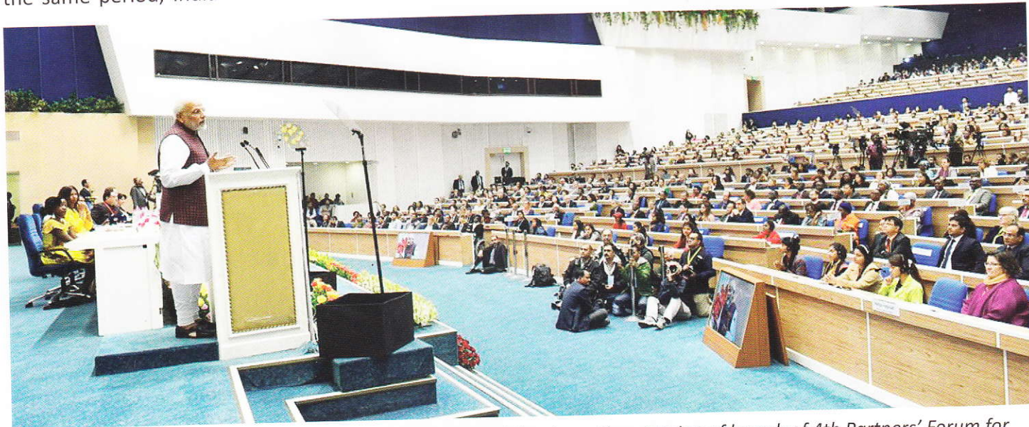
Prime Minister Shri Narendra Modi addressing the participants on the occasion of launch of 4th Partners' Forum for Health and Well-Being of Women, Children and adolescents in New Delhi.

Achieving reductions in maternal and newborn mortality begins with interventions well before the time of conception and delivery. Adolescence is a time of tremendous growth, and, unfortunately, girls can enter womanhood with nutritional deficiencies that put pregnancies at risk. In 2016, over half of our adolescent girls were anaemic. India aims to reduce this figure by making iron and folic acid tablets available to adolescent girls at health facilities. Our national adolescent health programme also has a key focus area on nutrition, as part of a strategy to comprehensively address health needs of adolescents in five key areas. Our recent success can also be attributed to the fact