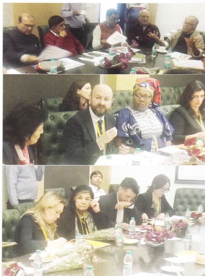
Delegation members interacting with Indian Parliamentarians.

During the discussion, issues related to maternal health, child health, and SRHR were discussed.