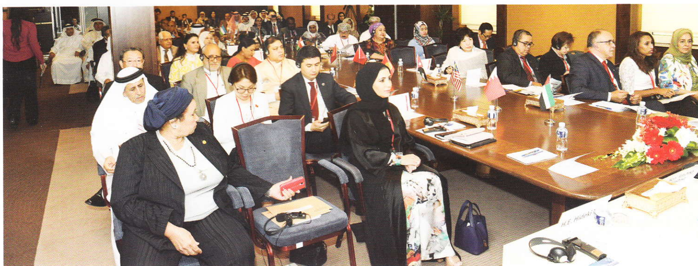
An inter-active session during the meeting.

During the field visit, the participants visited Bahrain Ministry of Education where they were briefed on the state of affairs of education in Bahrain and vocational training programmes for youth, followed by an active question and answer session. They then paid a visit to Bahrain Science Center for the SDGs, the first of its kind in this region dedicated to the SDGs under the supervision of the Bahrain Ministry of Youth and Sport Affairs. After the briefing, they made a tour of the Center. The participants were particularly interested in the country's efforts to widely enlighten people about the SDGs.