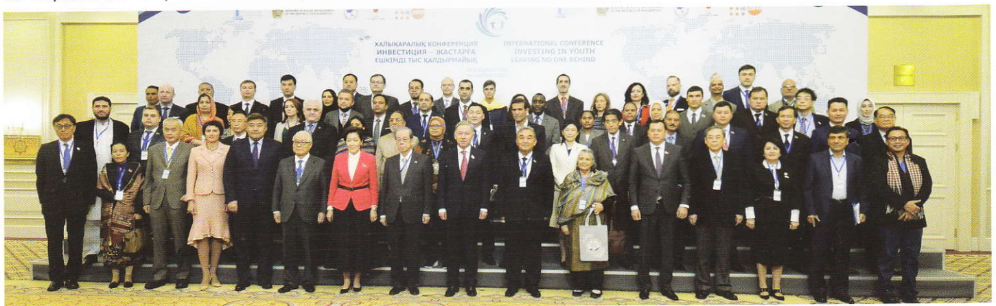
Group Photo of the participants.

The participants acknowledged that young people are inheriting a world where the global climate is changing faster than most people like to think and that youth have an increasingly strong social and environmental awareness, which has the power to transform societies towards a low-carbon and climate resilient future. The Conference agreed to address the need to promote participation of young people in global and regional development activities and programmes through increased mobility and connectivity among young entrepreneurs, students and researchers.