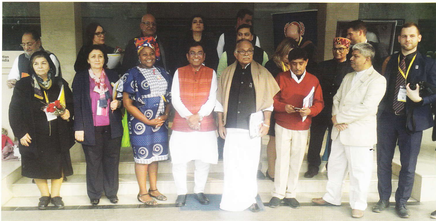
Delegation members with Indian Parliamentarians.