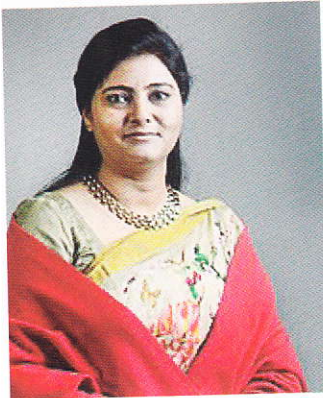
Ms. Anupriya Patel Union Minister of State for Health and Family Welfare

Anupriya Patel Union Minister of State for Health and Family Welfare Government of India